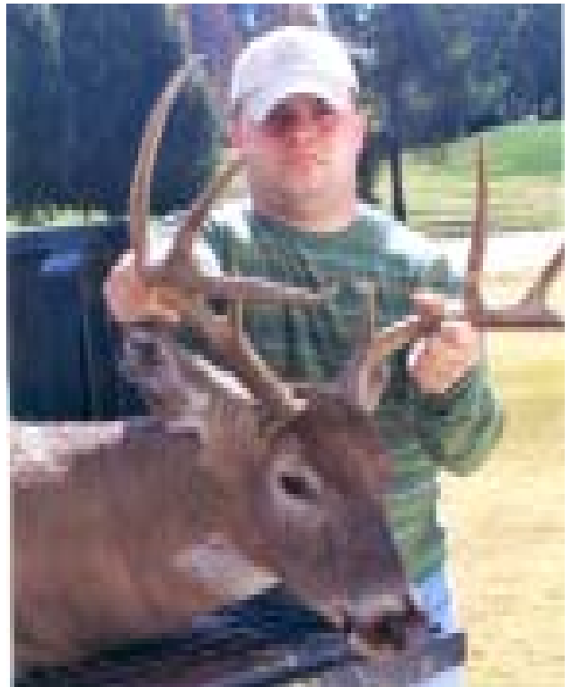
Indiana, December 2006