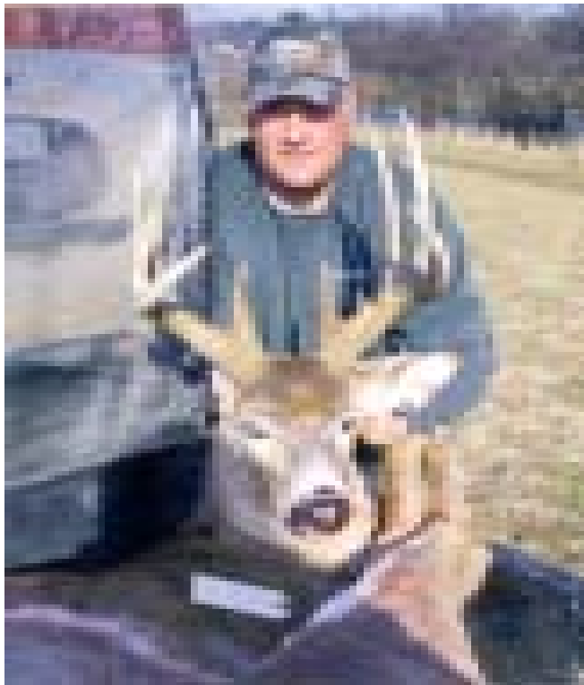
Dekalb County, October 2006