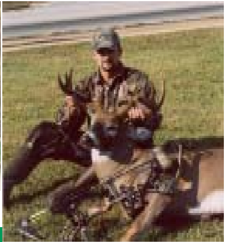
Gwinnett County - 11pt