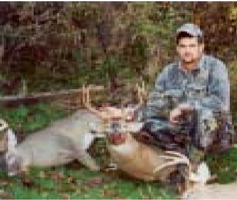
Bow Kill - 9pt Lawrence County, Ohio, Nov 7, 2006