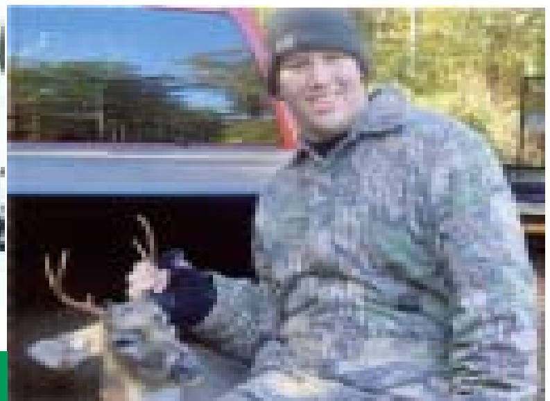
First Deer, October 21, 2006